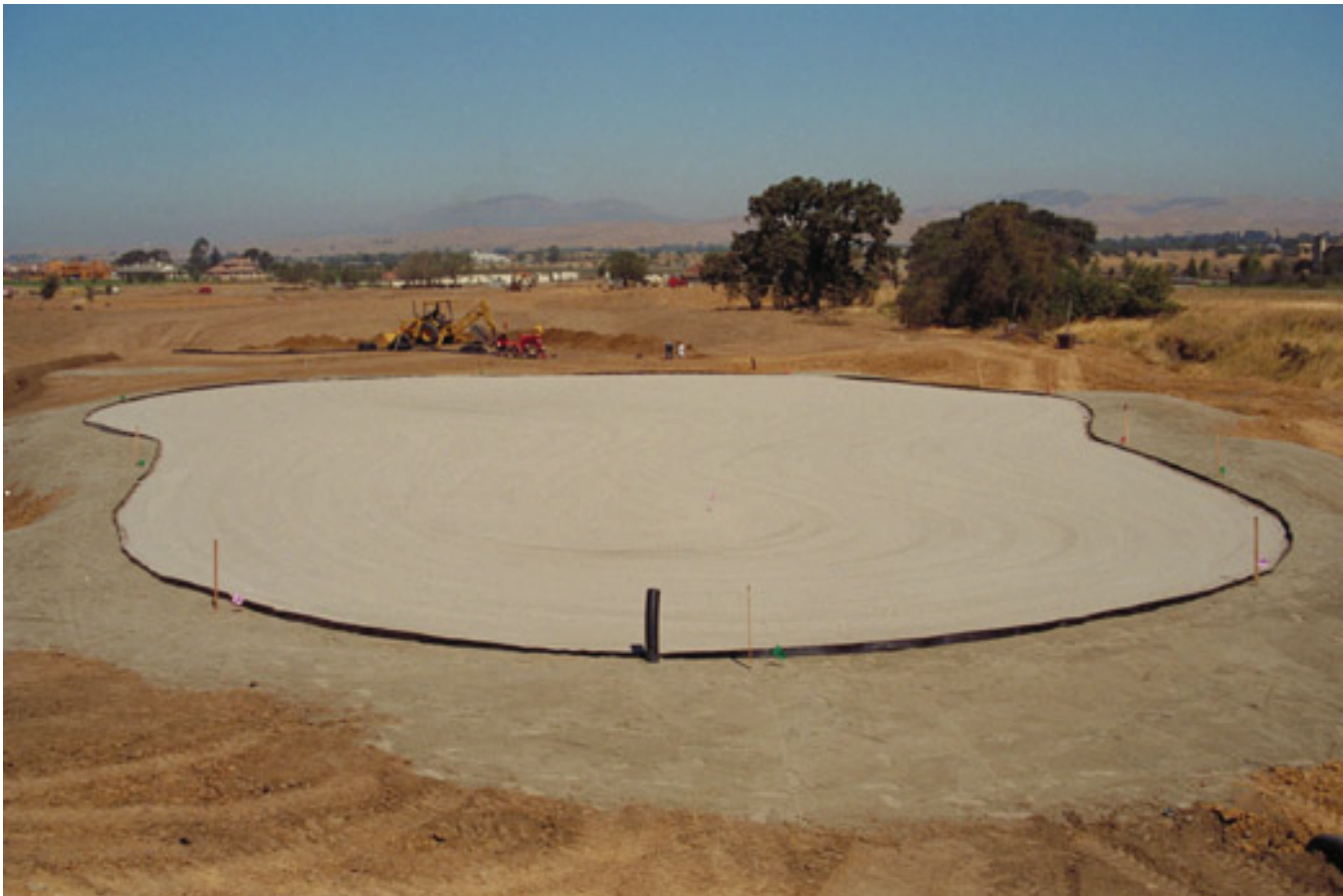
WB Installation - 1996

By lining the outside of the green with DeepRoot WB 24-2 all three key issues were addressed.