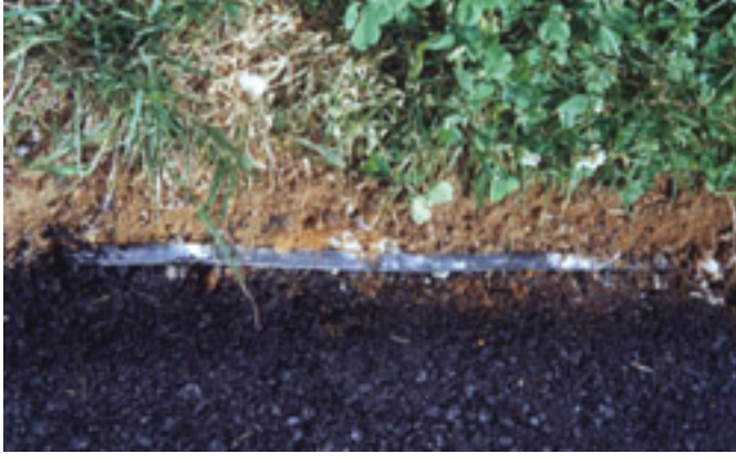
4. Barrier Detail