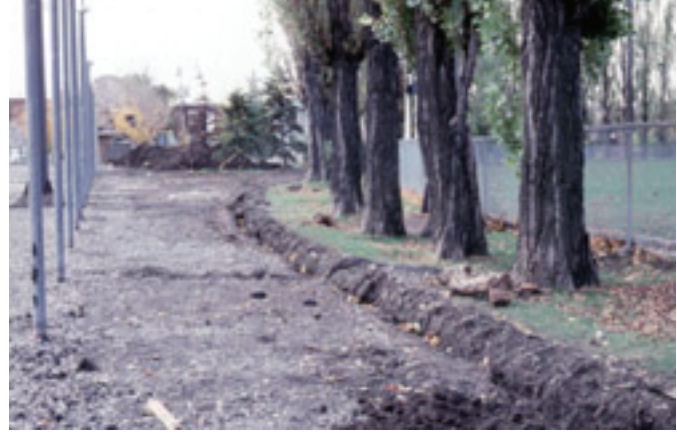
1. Before Pruning